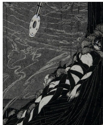
THE PIT & THE PENDULUM, Harry Clarke (1889-1931), 1919. Pen and ink, 9 x 7". TALES OF MYSTERY & IMAGINATION: EDGAR A. POE