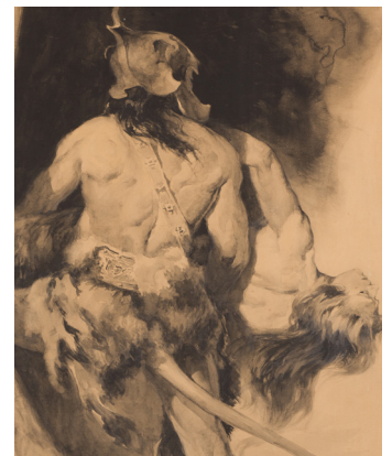
ABDUCTION OF JANE, J. Allen St. John (1872-1957), 1921. Watercolor, 25 x 16". TARZAN THE TERRIBLE: EDGAR R. BURROUGHS