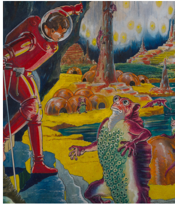
LIFE ON NEPTUNE, Frank R. Paul (1992-1963), 1940. Gouache on illustration board, 14 x 11". FANTASTIC ADVENTURES MAGAZINE