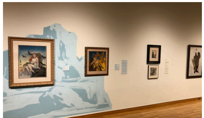
As exhibited at the South Bend Museum of Art: Nov. 2019- Jan. 2020