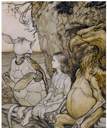
THE MOCK TURTLE, Arthur Rackham (1867-1939), 1907. Pen and ink, watercolor, 11 x 7". ALICE'S ADVENTURES IN WONDERLAND: L. CAROLL