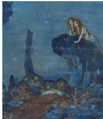
FULL FATHOM FIVE, Edmund Dulac (1882-1953), 1908. Pen and ink, gouache, 17 x 11". THE TEMPEST, ACT I: WILLIAM SHAKESPEARE