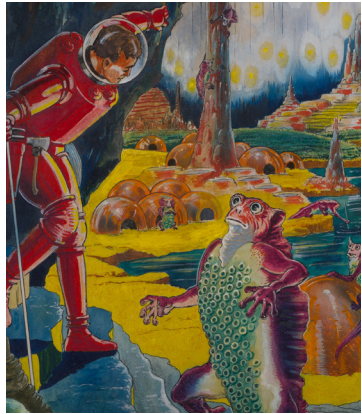
LIFE ON NEPTUNE, Frank R. Paul (1992-1963), 1940. Gouache on illustration board, 14 x 11". FANTASTIC ADVENTURES MAGAZINE