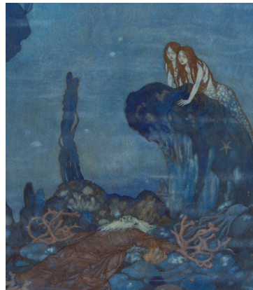
FULL FATHOM FIVE, Edmund Dulac (1882-1953), 1908. Pen and ink, gouache, 17 x 11". THE TEMPEST, ACT I: WILLIAM SHAKESPEARE