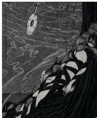
THE PIT & THE PENDULUM, Harry Clarke (1889-1931), 1919. Pen and ink, 9 x 7". TALES OF MYSTERY & IMAGINATION: EDGAR A. POE