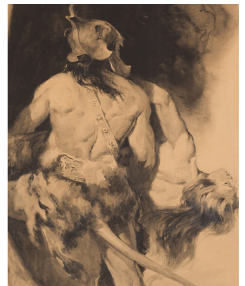
ABDUCTION OF JANE, J. Allen St. John (1872-1957), 1921. Watercolor, 25 x 16". TARZAN THE TERRIBLE: EDGAR R. BURROUGHS